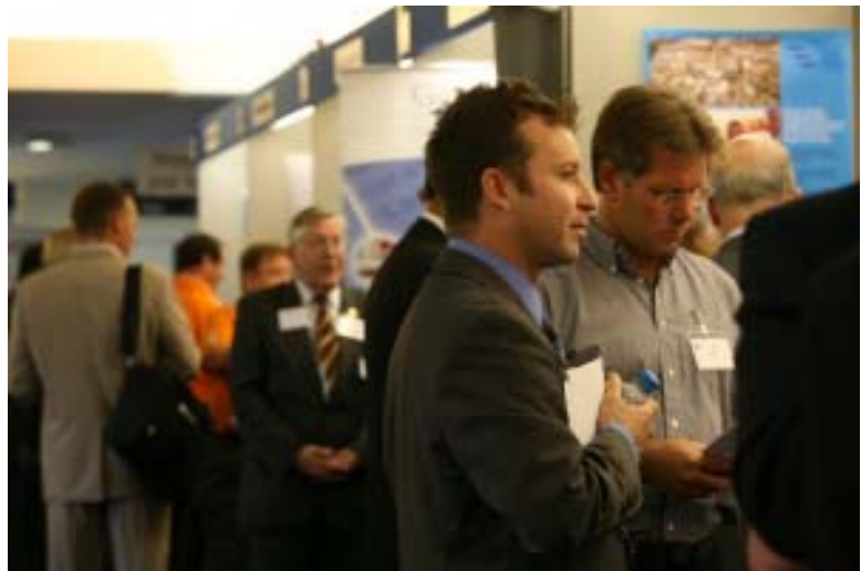
Delegates at the 09 Expo